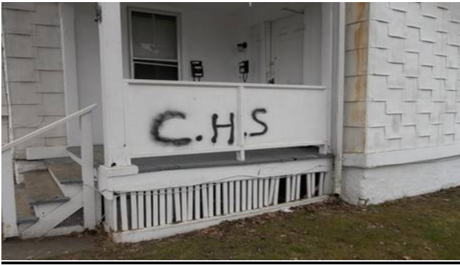
Cornhill Soldiers tag on a house in West Utica- outside the Cornhill neighborhood.