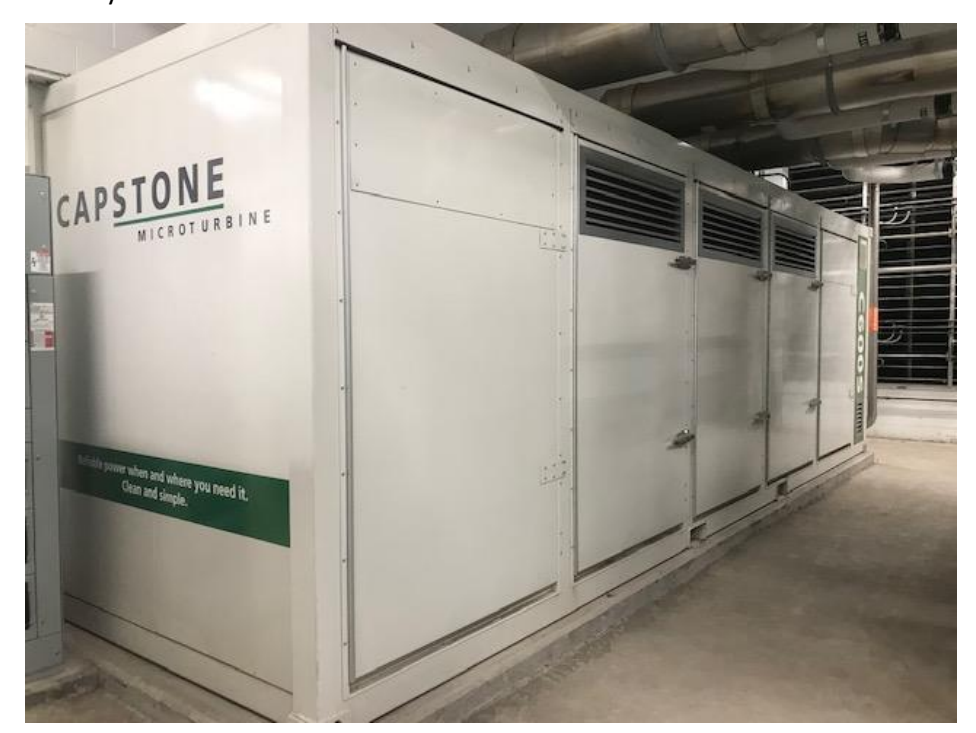
Figure 2. New Capstone microturbines at the Oneida County Water Pollution Control Plant.

Oneida County invested in a Unisons Solutions biogas conditioning system to remove siloxanes, moisture and Hydrogen Sulfide from the biogas, and three Capstone 200-kW microturbines and heat exchangers to recover energy from the biogas. After conditioning, the gas is channeled through the microturbines, which produce electricity and generate heat used to heat the digester complex and the liquid receiving station. There are plans to add two more 200-kW microturbines to increase capacity from 600kW to 1,000kW within the next few years.