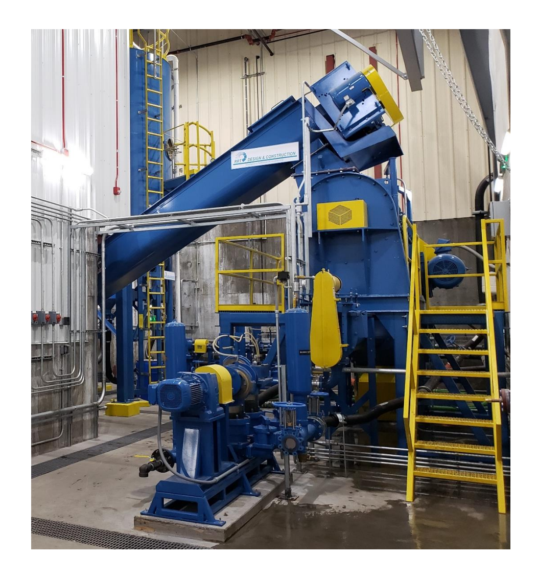
Figure 1. Scott Equipment THOR Turbo Separator in the Oneida-Herkimer Solid Waste Authority SSO Preprocessing Facility in the Eastern Transfer Station.

continuously mixed to prevent settling and more gray water added to dilute the slurry to a total solids (TS) content of 10%. Currently the slurry is hauled across the street to the WPCP by truck. Construction of a force main connecting the two facilities to pipe the slurry underground is in the works. OHSWA also will be installing a meter to measure percent solids, in order to manage the addition of gray water to achieve the 10% TS target for the slurry to be pumped to WPCP.