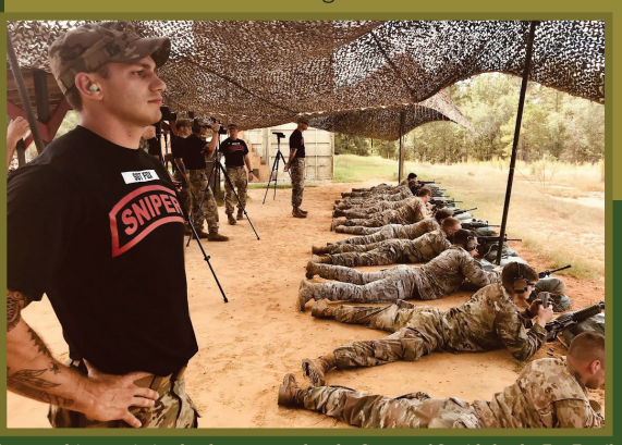
Photographic permission has been granted to the County of Oneida by the Fox Family