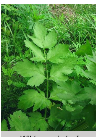
Wild parsnip leaf