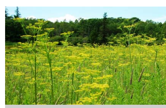
Wild parsnip infestation

coarsely toothed and compound, with 3-5 leaflets. Small, yellow flowers are clustered together in a flat-topped array approximately 3-8" across. Flowering usually occurs during the second year of growth, starting in May or June and lasting for 1-2 months. Seeds are flat, brown, and slightly winged to facilitate wind dispersal in the fall.