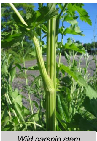
Wild parsnip stem