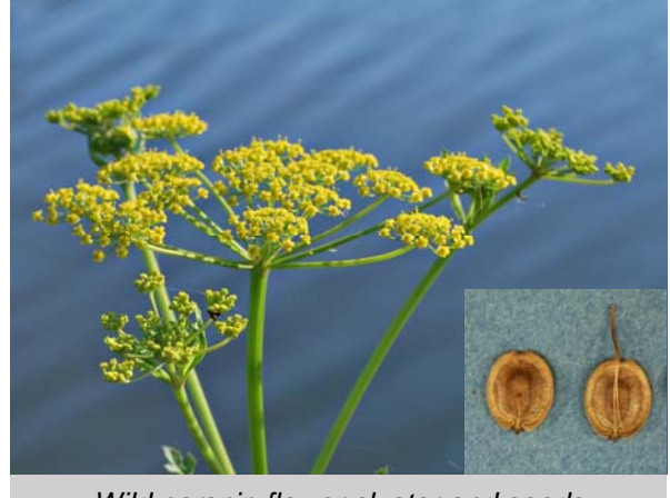
Wild parsnip flower cluster and seeds