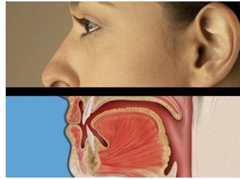
The same type of HPV infect the genital areas can infect the mouth and throat.

women, and oropharyngeal cancers are the most common among men. ☒ Despite these statistics, the use of HPV vaccination to prevent HPV infection is limited and immunization rates remain low.