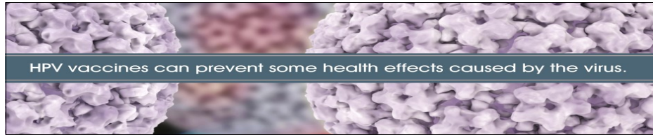
HPV vaccines can prevent some health effects caused by the virus.

HPV IS SO COMMON THAT NEARLY ALL SEXUALLY ACTIVE MEN AND WOMEN GET THE VIRUS AT SOME POINT IN THEIR LIVES. (cdc.gov)