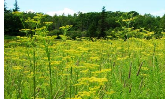
Wild parsnip infestation

Wild parsnip can grow up to 5' tall and has hollow, grooved stems that are hairless. Leaves resemble large celery leaves. They are yellow-green, coarsely toothed and compound, with 3-5 leaflets. Small, yellow flowers are clustered together in a flat-topped array approximately 3-8" across. Flowering usually occurs during the second year of growth, starting in May or June and lasting for 1-2 months. Seeds are flat, brown, and slightly winged to facilitate wind dispersal in the fall.