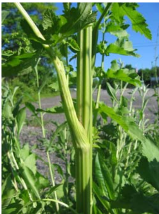
Wild parsnip stem