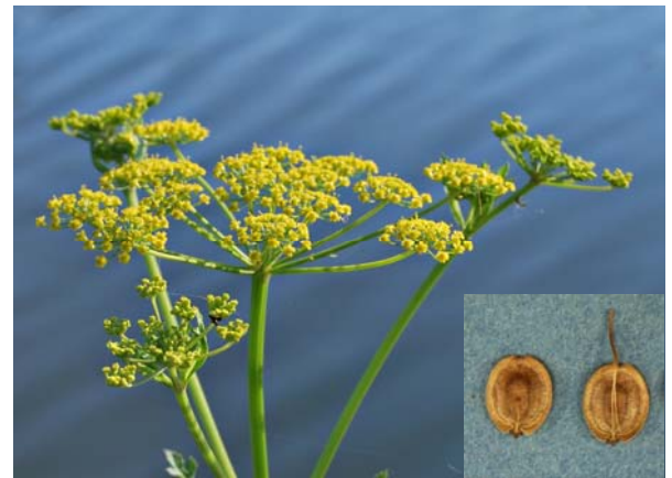
Wild parsnip flower cluster and seeds Seed Photo: Bruce Ackley, Bugwood.org