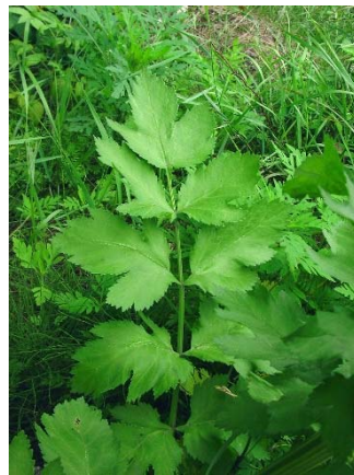
Wild parsnip leaf