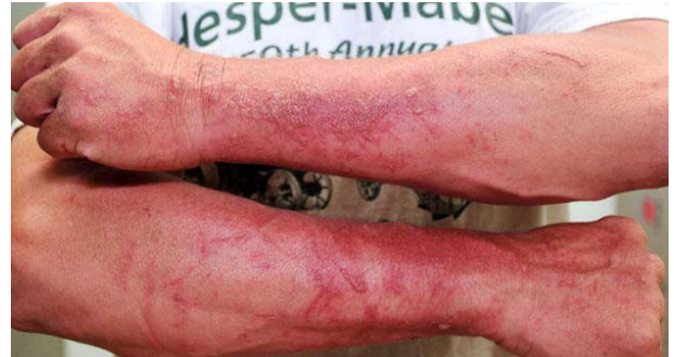
Burns from wild parsnip